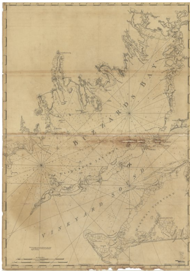
Map of 1776 of Buzzards Bay.